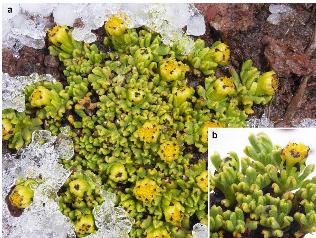
Fig. 3. Senecio moqueguensis Montesinos: a , habit; b , detail of the leaves [Pictures by J. Calvo at Toro Mount (Oruro, Bolivia)].