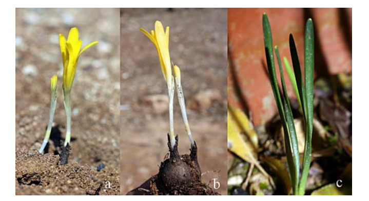
Fig. 2. Sternbergia colchiciflora: a , b , "Banka" locality in the western Mateen Mountain, photo by S. Youssef, 15 Oct 2015; c , cultivation, photo by E. Véla, 5 Feb 2017.

Observations.—At a global scale, S. colchiciflora occurs over a very wide area in southern Europe, the Mediterranean region, and