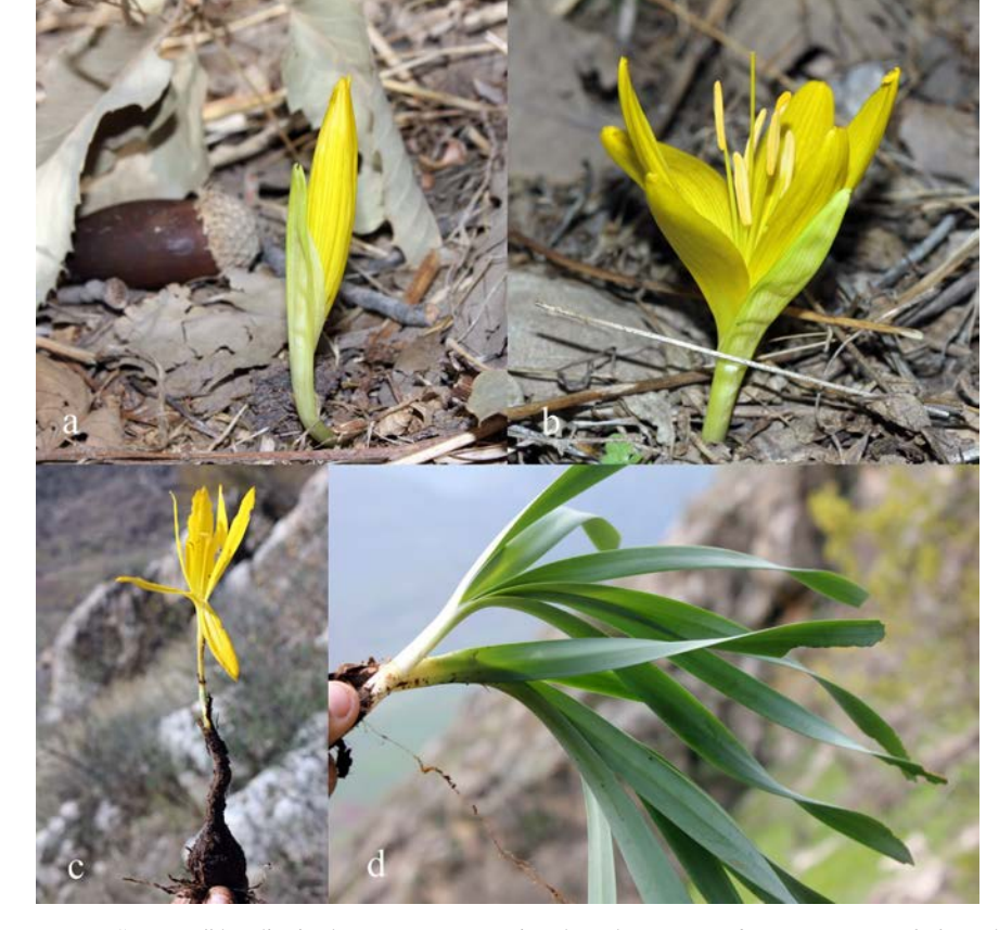
Fig. 3. Sternbergia clusiana: a , b , "Mergué" locality in the Mateen Mountain, photo by S. Youssef, 24 Oct 2015; c , ibidem , photo by S. Youssef, 4 Dec 2014; d , ibidem , photo by S. Youssef, 4 Apr 2015.

Observations. —It is a common and widespread species in the eastern Mediterranean and the Irano-Anatolian mountains (Mathew, 1983, 1984), occurring in southern Turkey, Syria, Lebanon, Israel, Jordan, and throughout Iraq to Iran. Sternbergia clusiana has been considered as a lost species in the Iraqi territory for more than 60 years. It has been rediscovered in this study on a rocky steep slope at Mergué hamlet in the eastern Mateen Mountain —37° 3' 56'' N, 43° 43' 54'' E (Fig. 1). This population was not registered in Flora of Iraq (Wendelbo, 1985).