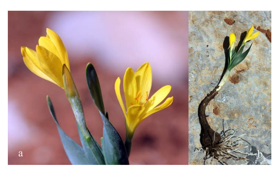
Fig. 4. Sternbergia vernalis: a, b, near the village of Beduhê on the Berwarya Mountain, photo by S. Youssef, 21 Feb 2014.

The Kurdistan Region of Iraq is a rich territory in terms of floristic diversity as a part of the Irano-Anatolian hotspot and hosts a number of rare, threatened, and endemic species. We have characterised their habitat, vegetation community structure, and population size, and estimated the environmental threats. Due to their rarity status, with many of their natural habitats under threat, S. colchiciflora, S. clusiana, and S. vernalis should be regarded as potentially endangered species at a regional level, but without precision about the threat level because of lacking information -DDreg, i.e., "Data Deficient regionally"-, according to the IUCN criteria (IUCN Species Survival Commission, 2001, 2003; IUCN Standards and Petitions Working Group, 2006). However, the small population of S. fischeriana occurring near the Beduhé Dam after its recent construction, suggests that it was probably more abundant before the dam and its natural habitat has been impacted by it. Since the Iraqi flora is one of the less documented in the Middle East region,