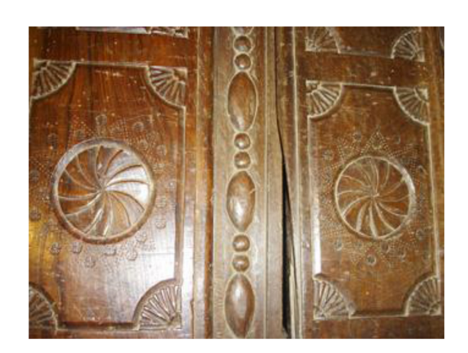
Fig. 2. An example of antique furniture ornamented with solar symbols.

Regarding household utensils, within the framework of the traditional economy of the ARD, based on productive subsistence systems, the elaboration of many objects and utensils for daily use was the responsibility of the inhabitants themselves. The use of simple techniques and knowledge of the whole process by each person are the main characteristics of this