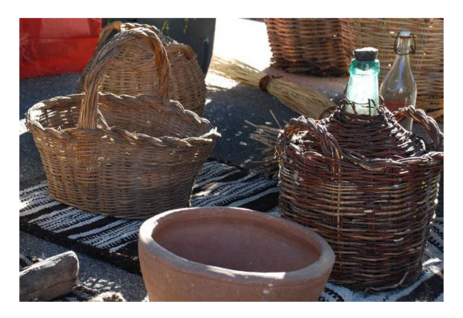
Fig. 4. Different elements characteristic of traditional basket-making in the Arribes del Duero.

If the basket to be made was small and fine, arbustive species were used ( Cytisus sp. pl., retama or Osyris alba ), although they were less resistant than those made of willow. To a lesser extent the fine branches of fresno and chopa were also used in basket-making. Some informants indicated: "we used to take advantage of everything around us". Indeed, the young shoots and the thin branches from the pruning of certain cultivated woody species, in particular from almond trees ( Prunus dulcis (Mill.) D.A. Webb), cherry tree and olive tree, were used in popular basket-making. For example, olive branches were used to do rough work because they are less flexible than willow.