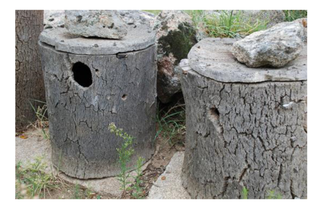
Fig. 3. Traditional cylindrical beehives made with sheets of cork.

As well as the above uses, cork is also used to make beehives. Those made today are square and are formed of five parts: four for the side walls and a cover for the top. Previously, however, they were cylindrical in shape, taking advantage of the rounded shape of the sheets of bark taken when harvesting the bark of cork trees. It was only necessary to join two pieces to obtain a cylinder, whose top part was covered with another small round sheet of cork, nailed in place with long wooden nails made from jara (Fig. 3).