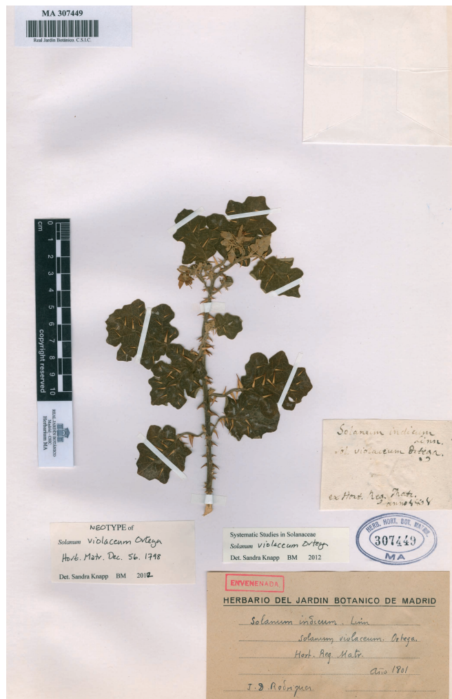
Fig. 2. Neotype of Solanum violaceum Ortega (MA 307449).

correspond to the protologue, and in addition to being a poor specimen does not have the long straight fruiting pedicels of material currently identified as S. violaceum . The flowering sheet (MA 307449, Fig. 2) corresponds better to the protologue description of sinuate leaves “cordatis sinuatis” with cordate bases, has a date consistent with it being cultivated when Gómez Ortega’s tenure as director and is thus the logical choice for a neotype. Although the sheet is dated 1801, this species does not appear in Cavanilles’s (1802) teaching list.