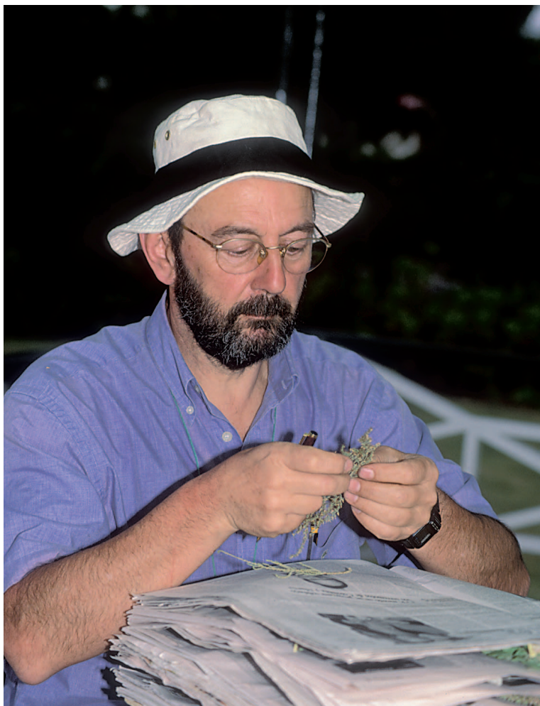
Ladysmith, Sudáfrica. 1999